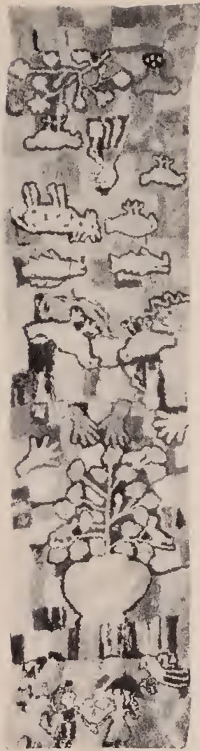
SAMPLER HOOKED RUG